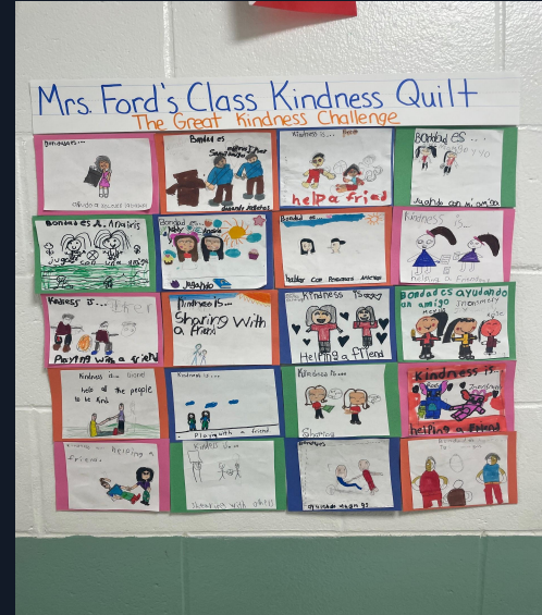
Great Kindness Challenge