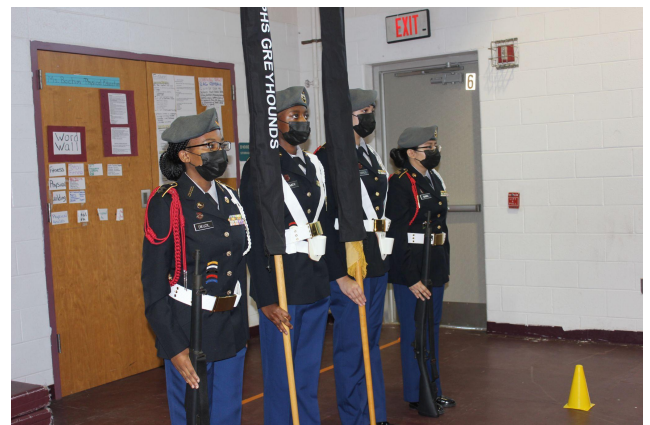
Battalion Drill (Cont.)