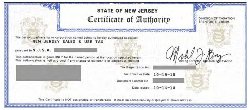
Sample Certificate of Authority

All bidders are to submit their Sworn Contractor Certification, a current valid "Certificate of Authority" as issued by the New Jersey Department of Treasury. Reference—N.J.S.A. 18A:7G-37.