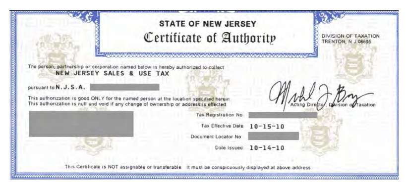
Sample Certificate of Authority

All bidders are to submit their Sworn Contractor Certification, a current valid "Certificate of Authority" as issued by the New Jersey Department of Treasury. Reference—N.J.S.A. 18A:7G-37.