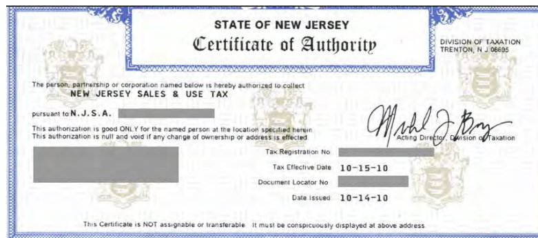
Sample Certificate of Authority

All bidders are to submit their Sworn Contractor Certification, a current valid “Certificate of Authority” as issued by the New Jersey Department of Treasury. Reference—N.J.S.A. 18A:7G-37.