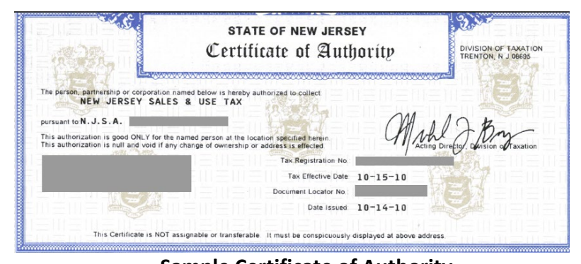
Sample Certificate of Authority

All bidders are to submit their Sworn Contractor Certification, a current valid "Certificate of Authority" as issued by the New Jersey Department of Treasury. Reference—N.J.S.A. 18A:7G-37.