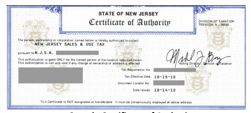
Sample Certificate of Authority

All bidders are to submit their Sworn Contractor Certification, a current valid "Certificate of Authority" as issued by the New Jersey Department of Treasury. Reference—N.J.S.A. 18A:7G-37.